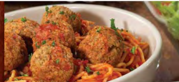
Spaghetti and Meatballs

Consuming raw or undercooked meats, poultry, shellfish or eggs may increase your risk of food borne illness, especially if you have certain medical conditions present. Suggestions or comments are welcome at www.zios.com . Prices subject to change without notice.