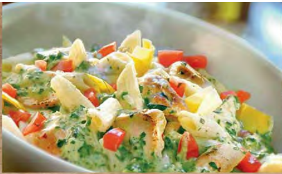
Artichoke Spinach Pasta