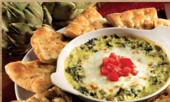
Artichoke Spinach Dip

Our delicious cheese ravioli lightly hand-breaded and fried golden brown. Served with hearty meat sauce. $39.99